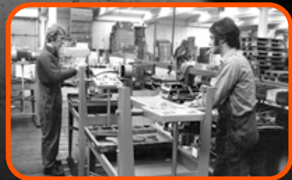
Production of Clipper masonry saws in Bascharage, Luxembourg in the 1960's

Norton Clipper pioneered masonry cutting with the invention of the first masonry saw—and we've been refining the technology ever since.