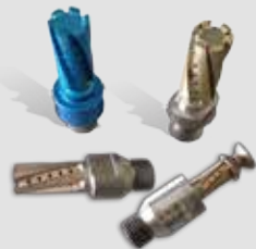
Metal bond diamond Routers