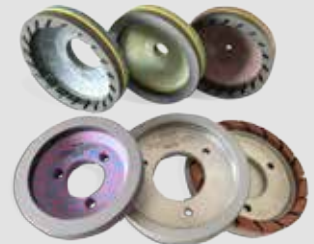
Resin bond diamond cup wheels