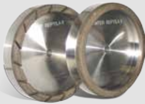
Metal bond diamond cup wheels