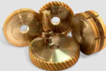
Metal bond diamond peripheral wheels