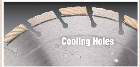
Ventilated steel center with cooling holes to reduce heat when cutting