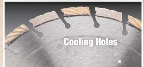
Ventilated steel center with cooling holes to reduce heat when cutting