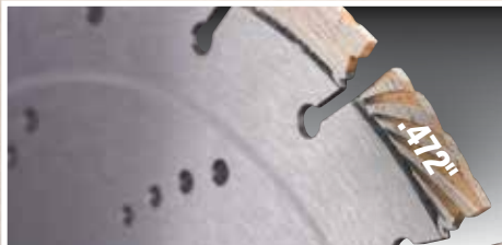
A .472" impregnated diamond segment for longer life, smoother finish and faster cutting