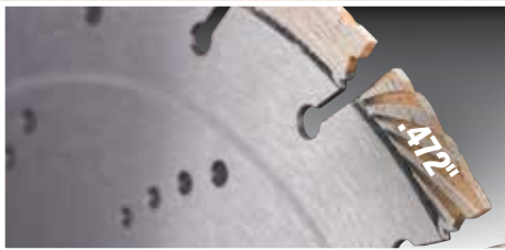
A .472" impregnated diamond segment for longer life, smoother finish and faster cutting