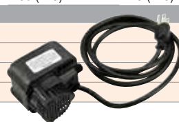
Electric Water Pump

Genuine Norton diamond blade included with saw.