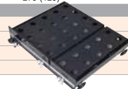
Conveyor Cart Replacement