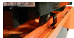
ANTI PIVOTING SYSTEM