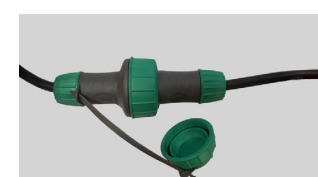
EASY WATER PUMP PLUG