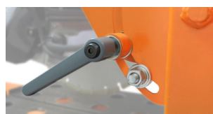
ADJUSTABLE CUTTING-DEPTH HANDLE