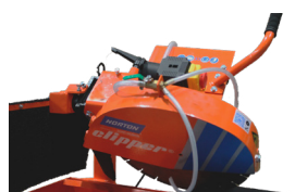
TILTING HEAD (90° - 45°)