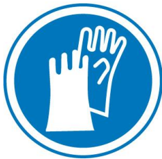
Hand protection must be worn