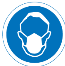
Airway protection must be worn