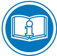
Read operator's instructions

Important warnings and pieces of advice are indicated on the machine using symbols. The following symbols are used on the machine: