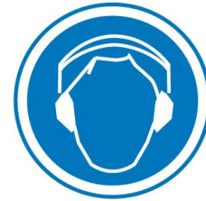
Ear protection must be worn