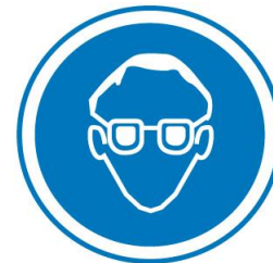
Eye protection shall be worn